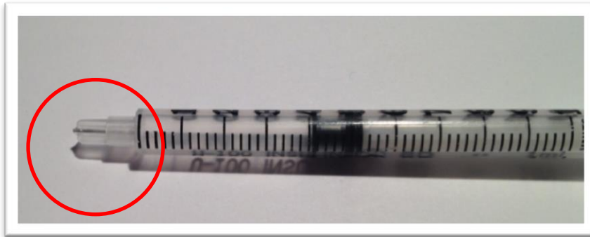
Fig 1. 1ml disposable insulin syringe with needle removed at hub