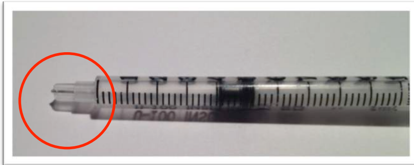
Fig 1. 1ml disposable insulin syringe with needle removed at hub